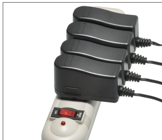
Figure 2. Counter Stations and Hub sharing power.