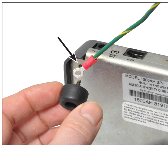
Figure 1. Attaching ground wire to Counter Station.

16AWG stranded wire, insulated crimp-on ring terminals for #8 screws.