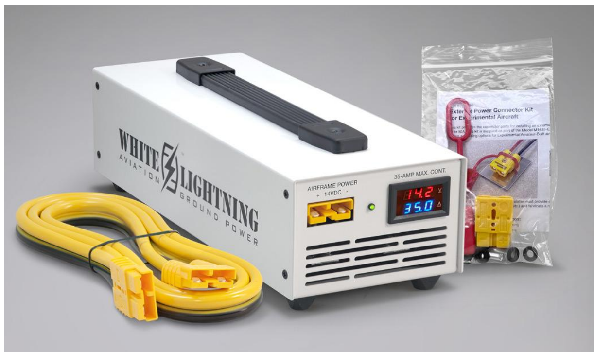
Model M1435-EXP 14-Volt 35-Amp Maximum Continuous