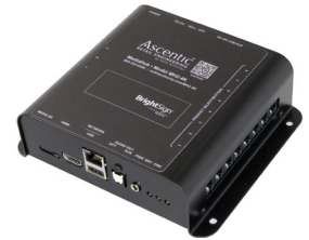
Compatible with Ascentic MediaHubs

The Ascentic LM8 LED controllers are available in 24V or 12V versions. Up to eight LEDs or arrays can be controlled via serial commands. There are two LED connection options for the LM8 series: one with removable screw terminal blocks (shown here) and one with barrel ports.