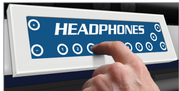
TOUCHSELECT CONTROL PANELS