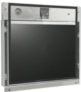
Model 1529VO 15 inch video chassis for OEM Drive-ups. Other models available with integrated call button, speaker, and microphone.

The 1527 / 1529 Series is an approach to two-way video communications that offers durable performance and economical packages. These units include a camera and video display that connect to a 1520 Lane Station with one Cat 5 cable. The special outdoor camera utilizes technology that can render sharp details in images even with strong backlight and/or deep shadow conditions. The LED back-lit screen delivers bright, clear video images with minimal power usage.