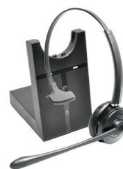
MODEL 1542V WIRELESS HEADSET