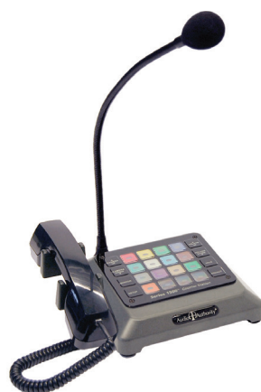
MODEL 1500AH COUNTER STATION