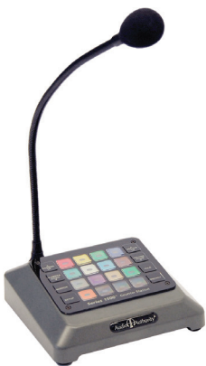
MODEL 1500A COUNTER STATION

Using the 1550A Setup Tool, volume levels and system configuration for the entire system can be adjusted from one of the Counter Stations.